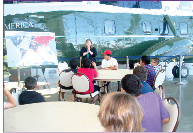
Students participating in the VNY summer 2012 Aviation Careers Education Academy (ACE) program learn more about aviation careers through discussions with professionals in the field (left) and field trips, such as to the Ronald Reagan Presidential Foundation & Library.

VNY hosted another successful Aviation Careers Education Academy (ACE) program this summer for middle and high school students interested in aviation careers.