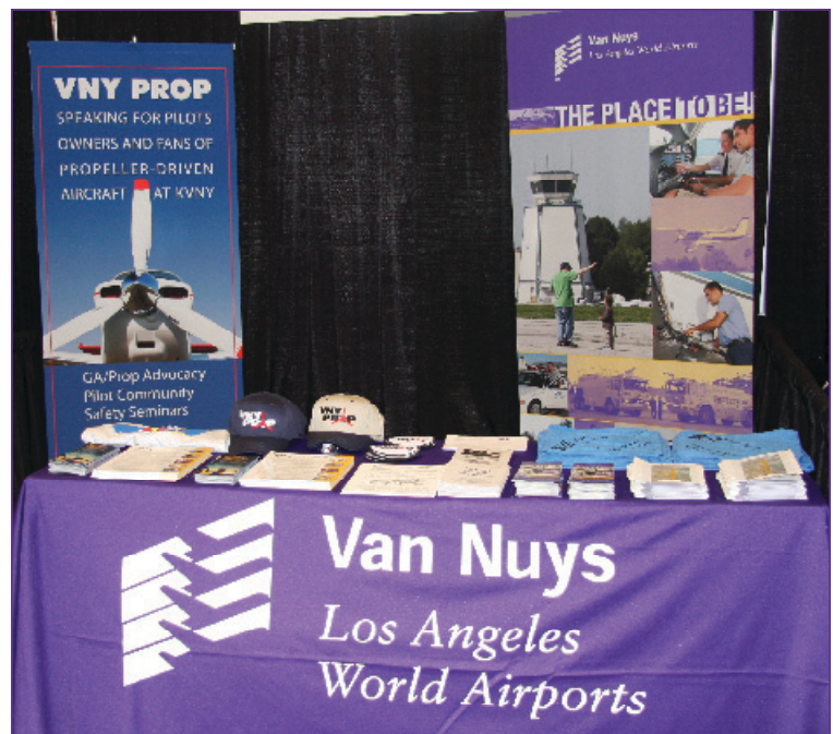
VNY and the Van Nuys Propeller Aircraft Association have their booth ready to go at the Aircraft Owners and Pilots Association's 2012 Aviation Summit.

Highlights of this year's event included a parade of about 100 propeller aircraft "driving" on the streets of Palm Springs from the airport to the Convention Center. The 2013 summit will take place in Fort Worth, Texas. To learn more, visit www.aopa.org/summit/ .