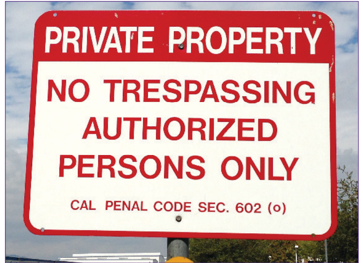
Proper signage at VNY helps with the enforcement of existing laws.

Because the airport has many tenants and sub-tenants and provides repair services and storage of aircraft, there are often disputes over non-payment or property issues. These types of issues are in most cases civil in nature, meaning they are typically not crimes and are not prosecuted in criminal courts. Remedies must be sought in a civil court. Airport Police are often requested to assist in the enforcement of a civil action, and grant access to areas or facilitate a remedy.