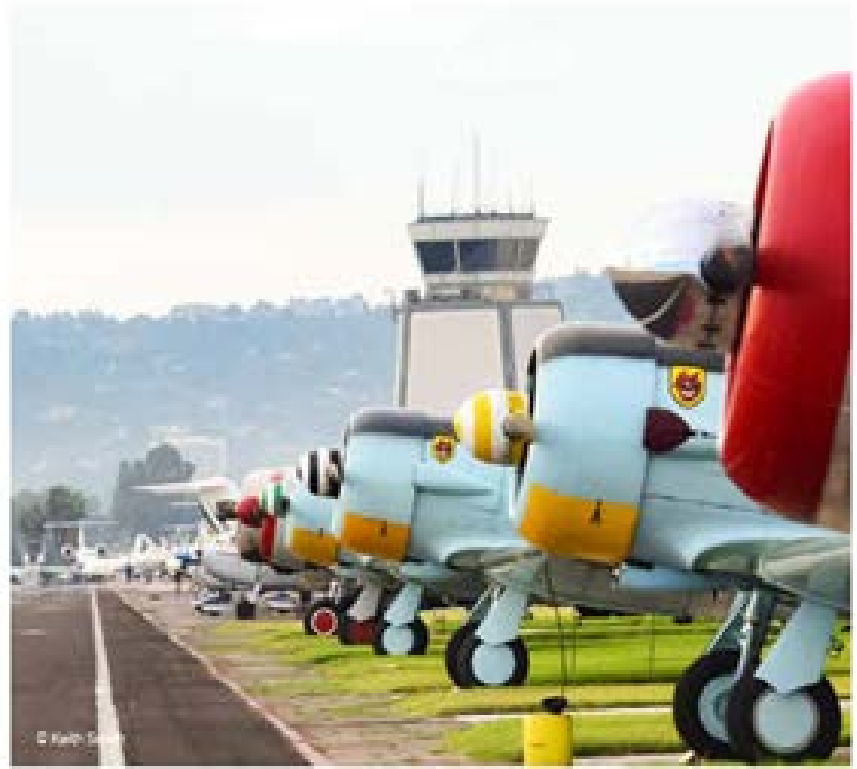
Van Nuys Airport