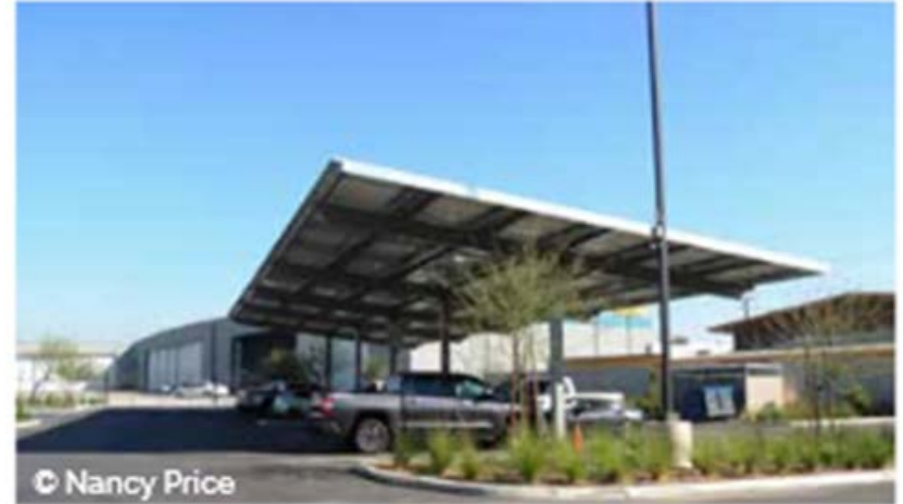
Solar panels at VNY help to reduce the Airport's greenhouse gas emissions.