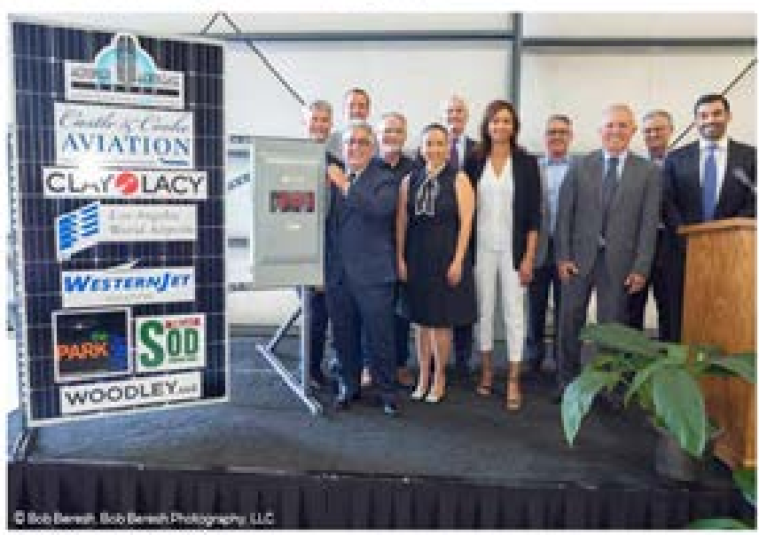
. ARX staff and partners commemorate the official launch of the Aempley, Rendesse stair metallistics.

In 2018. LAWA completed the Aeroplex/Aerolease solar project and announced six new tenant solar projects at VNY.